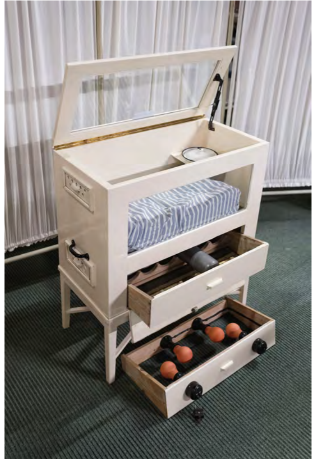
Incubator & bottle warm-keeper