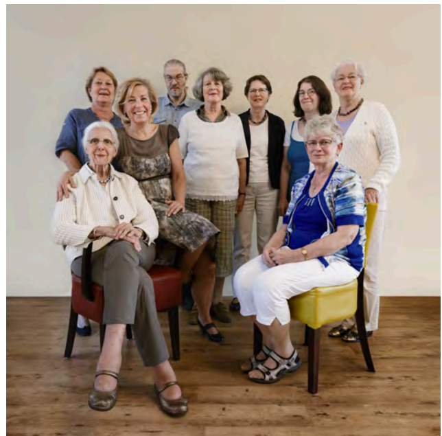
Nine of the volunteering staff-members who have registered and maintained this collection in the last decades, August 2016

In our view, this membership must be understood as a 'tribute' to the nurses who voluntarily took the pains to collect, describe and maintain all nursing objects that once were donated to SHVB. Like many cyclical practices, this work