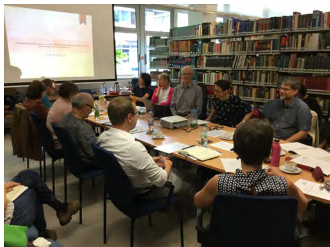
Participants of the Workshop 2019, Library of the Institute for Medical History and Ethics, University of Heidelberg

Both the structures and the content of nursing training are currently undergoing profound changes in Germany. These reforms have their roots in debates that had begun already at the end of the 1980s and were linked to fundamental questions about the basic ideas of what nursing professions should be. Some of these discussions go back even further. The 6th workshop of the German Association for the History of Nursing took place on 15 June 2019 at the Institute of Medical History and Ethics at the University of Heidelberg. Its objective was to historically contextualise these debates while also investigating some other healthcare professions.