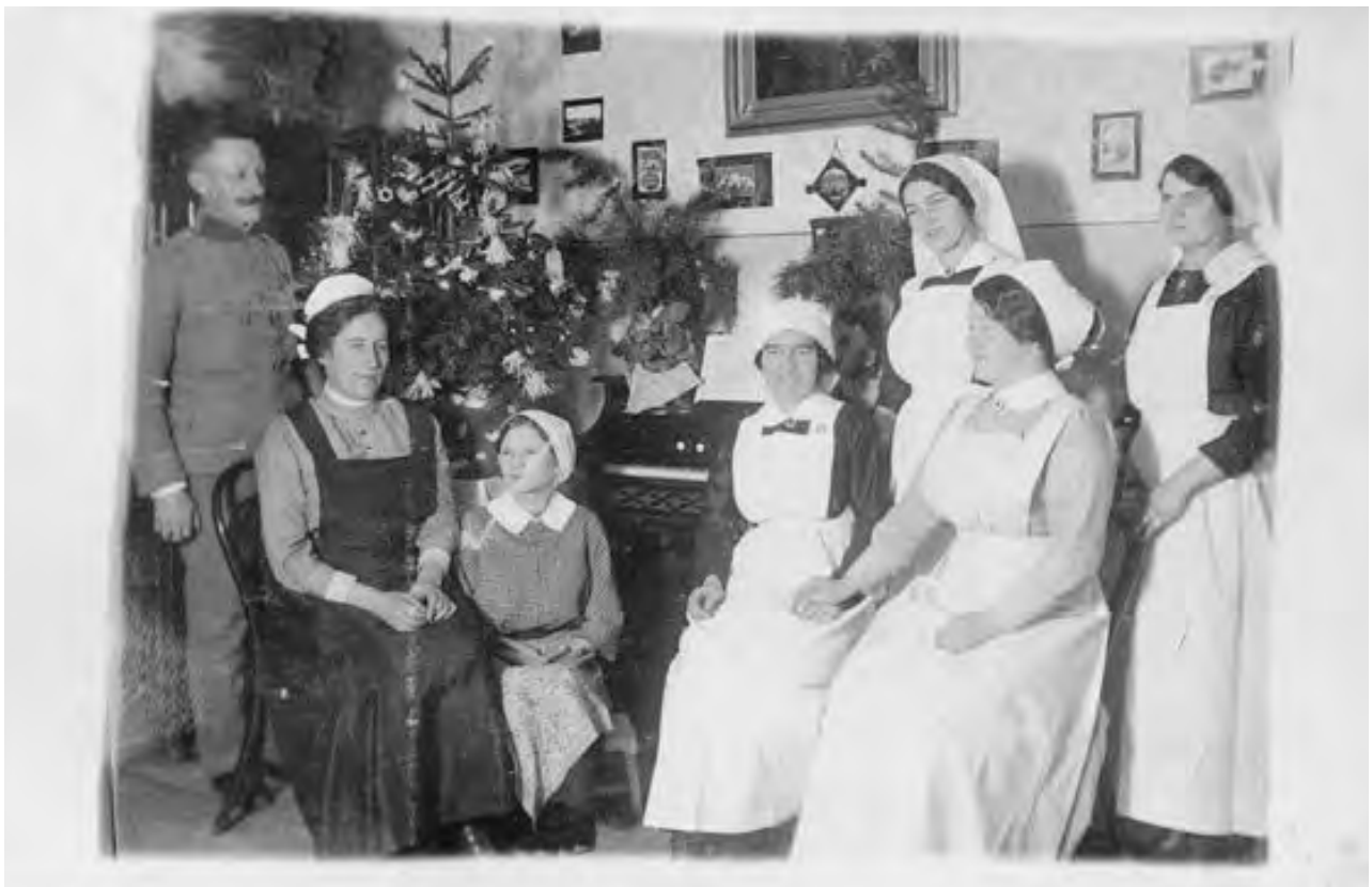
Redcross Nurses and Soldiers celebrating Christmas in in the Military Hospital in Kolin-Böhmen, 1915

Italian Nurses' Association with a Nursing History Group, CNAI (Consociazione nazionale delle Associazioni infermiere/i) is hosting the EAHN Coordinating Committees annual meeting in Florence, Italy on Thursday 13 th of February 2020, 10.00 to 1.30 at the British Institute. Further information will be provided via email.